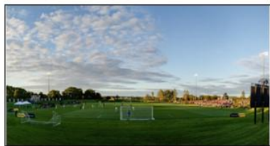
IOWA SOCCER COMPLEX