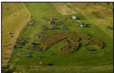
BILL AND JIM ASHTON CROSS COUNTRY COURSE