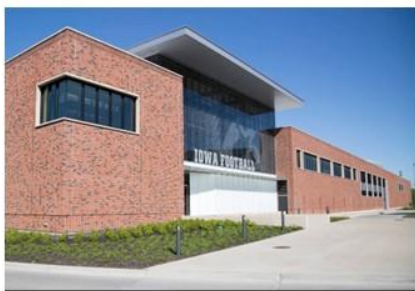
STEW & LENORE HANSEN FOOTBALL PERFORMANCE COMPLEX