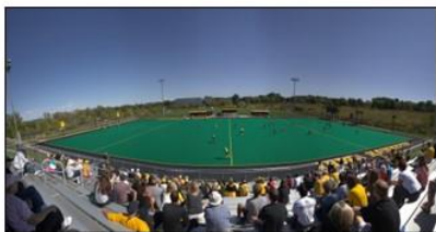
DR. CHRISTINE H.B. GRANT FIELD