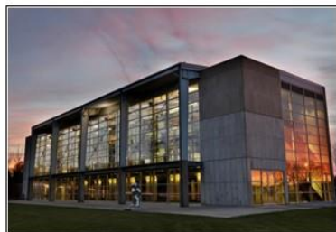
ROY G. KARRO ATHLETICS HALL OF FAME