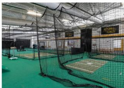
JACOBSON HITTING FACILITY