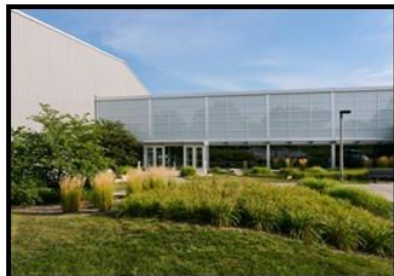
HAWKEYE TENNIS & RECREATION CENTER