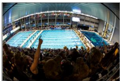
CAMPUS RECREATION & WELLNESS CENTER