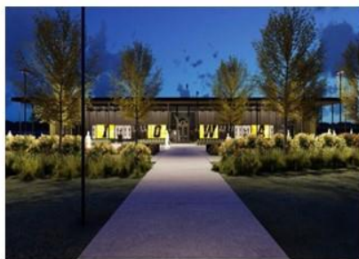
GOSCHKE FAMILY WRESTLING TRAINING CENTER