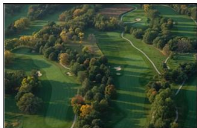
FINKBINE GOLF COURSE