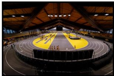
IOWA INDOOR TRACK BUILDING