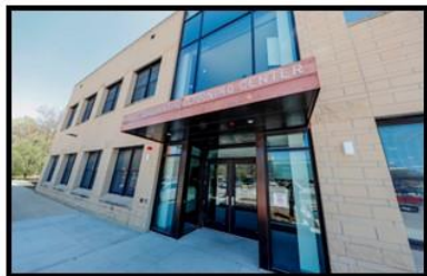
GERDIN ATHLETIC LEARNING CENTER