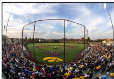
DUANE BANKS FIELD